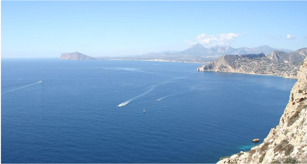
Somewhere along the Costa Blanca, between Valencia and Alicante

Pauwels Travel Bureau Ltd. 95 Dalhousie Street, Brantford, Ontario N3T 2J1, Canada Tel: 519-756-4900 / 519-753-2695 - Fax: 519-753-6376 tours@pauwelstravel.com – www.pauwelstravel.com