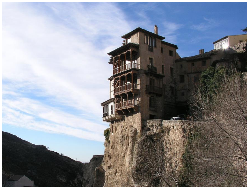
The famous hanging houses of Cuenca!