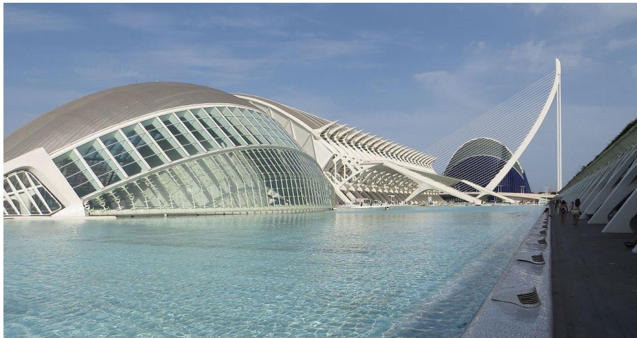
Valencia's City of Arts and Sciences

After breakfast, we motor from Cuenca into the region known as Levante, “land of the rising sun,” Spain sunny eastern seacoast, stretching north and south of its great metropolis, the historical city of Valencia (200km). Arrival in Valencia around noon, and visit to the futuristic museum complex known as the City of Arts and Sciences ( http://en.wikipedia.org/wiki/Ciutat_de_les_Arts_i_les_Ci%C3%A8ncies ), where you will be amazed by the spectacular, ultra-modern architectural creations of masters such as Sir Norman Foster and Santiago Calatrava: El Puente de l'Assut de l'Or, a bridge whose 125-meter high pillar is the highest point in the city; L'Agora, a covered plaza in which concerts and sporting events are held; L'Umbracle, a landscaped walk with plant species indigenous to Valencia, such as lavender, honeysuckle, and bougainvillea, and sculptures by contemporary artists, including Yoko Ono. We also visit L'Oceanogràfic, the largest aquarium in Europe, featuring an incredible variety of creatures from the Atlantic Ocean and the Mediterranean Sea, including sharks, belugas, walruses, and penguins, and the Prince Felipe Museum of Sciences, resembling the skeleton of a whale! In late afternoon we check into a first-class/4-star hotel. Dinner in the hotel.